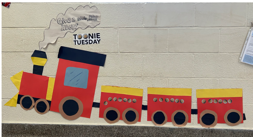
Bulldogs also showed gratitude and social responsibility by donating to our OCDSB's Education Foundation. Every cent earned goes right to our students in helping with food, clothing, educational opportunities, and important medical appointments. Thank you for your generosity Bulldogs!